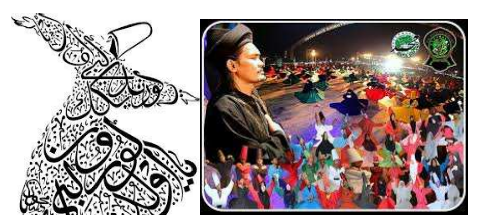
Figure 1. Illustration of The Whirling Dances Mafia Shalawat Indonesia

The NU missionary pattern that emphasizes adhering to national identity, respecting cultural diversity, and upholding human values is an Islamic marwah rahmatan lil 'alamīn .