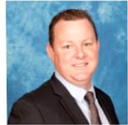
Deputy Principal Cleveland District State High School, Queensland