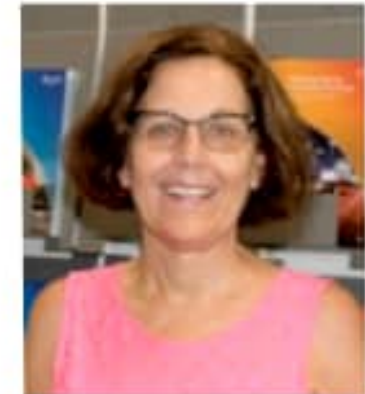
Adjunct Professor, James Cook University, Australia