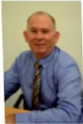
Director Professional Learning Queensland Association of State School Principals