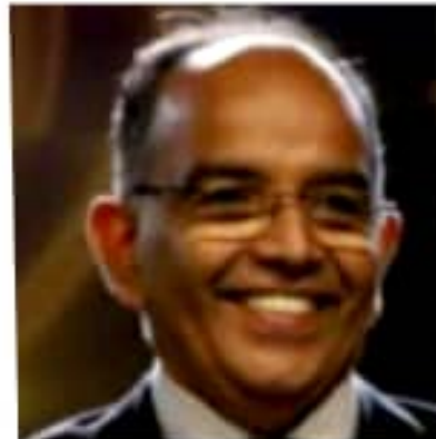
Foundation Professor, Brisbane Institute of Strengths Based Practice