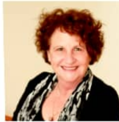
Education Consultant Aakom Management Australia