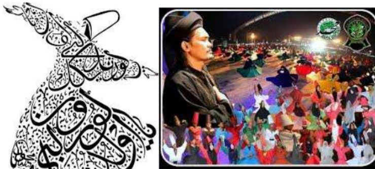
Figure 1. Illustration of The Whirling Dances Mafia Shalawat Indonesia

The NU missionary pattern that emphasizes adhering to national identity, respecting cultural diversity, and upholding human values is an Islamic marwah rahmatan lil 'alamīn .